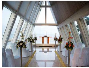
Conrad Wedding Chapel Jalan Pratama 16B Nusa Dua 80363 Studio Tonfon & andranatic 2016

The iconic chapel is located on the shores of Tanjung Banoa in the Nusa Dua tourism complex. The combination of ideas from two famous architectural firms, Studio Tonfon and andranatic, resulted in the asymmetrical triangular chapel. The shape of the building mass represents the relations of God, man, and nature. The asymmetric design is apparent in the contrast